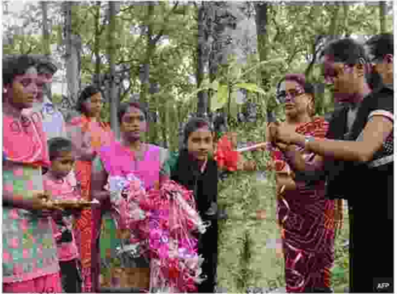
Women apply 'a Yakti' (sacred thread) around a tree during the celebration of Hindu festival Raksha-Bandhan in Sriharipuram on Aug. 29, 2015.